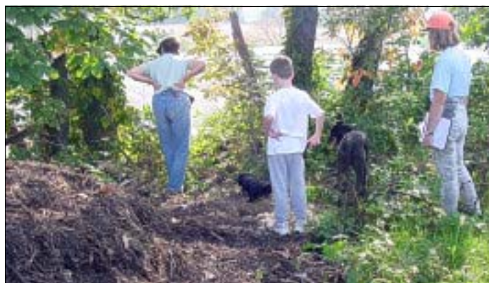
Iago checked many dens but none of them were active.