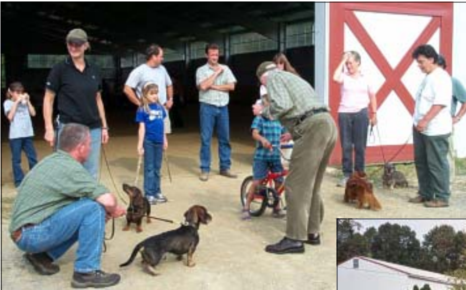
The practice session