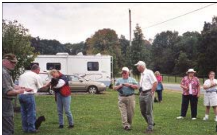
Congratulations were extended to all the participants of the Companion Dog Test.