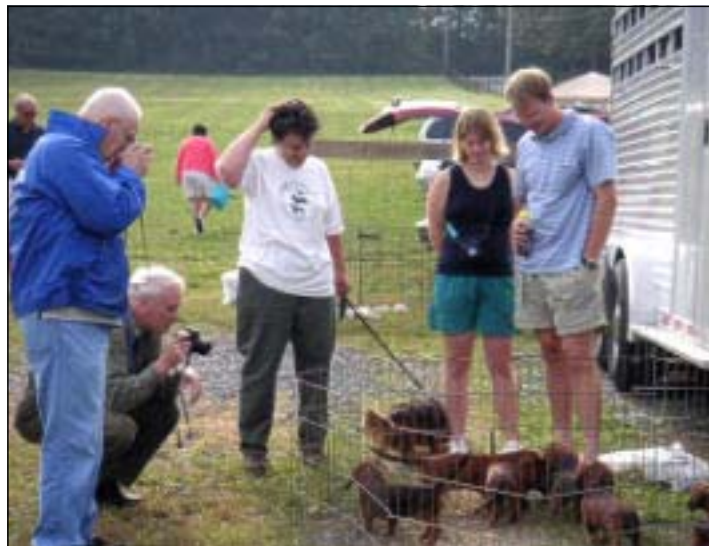
Patt's puppies attracted a great deal of interest.