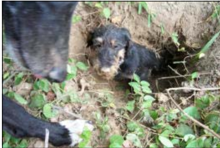
Ping emerging from the den