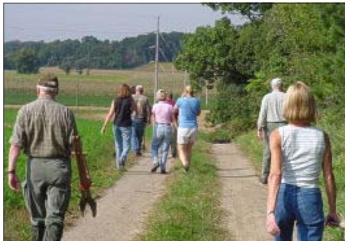
NATC members are going to watch den work in PA.